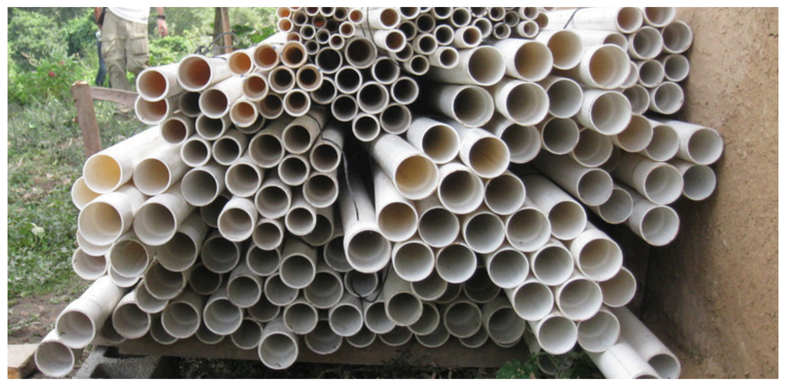
Storing PVC pipes for the Los Oreros System in Honduras