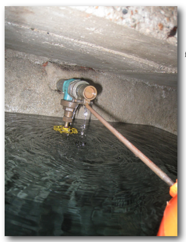
Checking out the system in EWB-NEU's El Chaguite project | Photo: M. Pellegrino